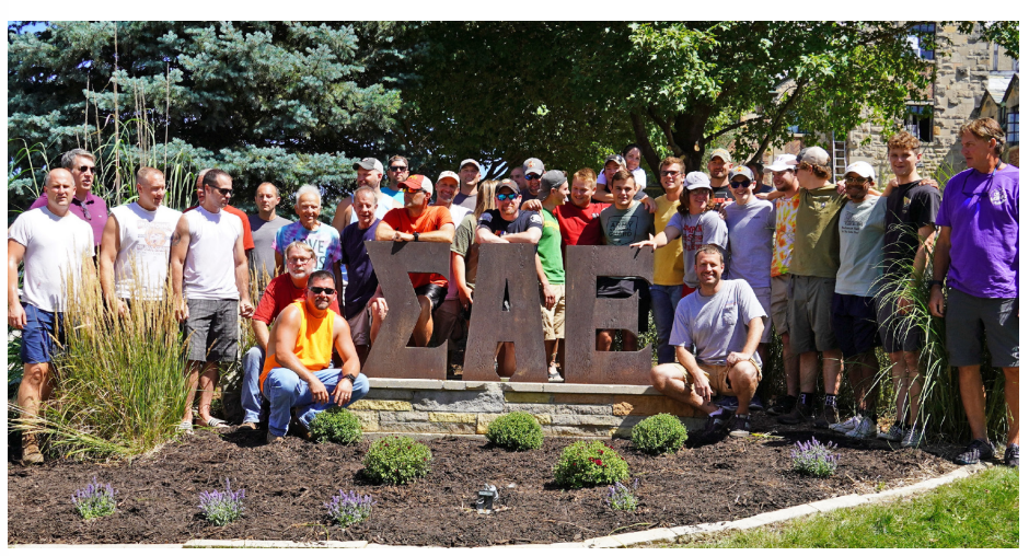
Over 40 alumni of the Iowa Gamma Chapter volunteered their time and energy to help restore the chapter house to its former glory

istorically, the Iowa Gamma Alumni Work П Weekend has occurred the weekend prior to Interfraternity Council (IFC) formal rush. This year was an extra-special work weekend, as it was the first one in six years! There was a lot of work to do. Over 40 alumni devoted their time and effort to helping the undergraduate members fix up the house on Lynn Avenue. This included cleaning, painting, making repairs, landscaping and other activities. We announced our return to campus by raising a new flag and unveiling our letters on the front lawn. Most importantly, the work weekend provided the undergraduate members an opportunity to bond, learn skills and meet Iowa Gamma alumni brothers from all over the United States.